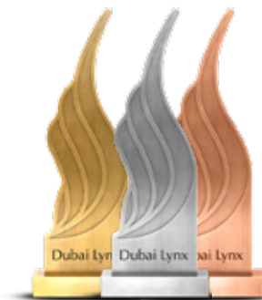
4 Awards for creating innovative products and creative campaigns