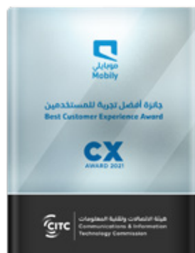
Best Customer Experience Award 2021