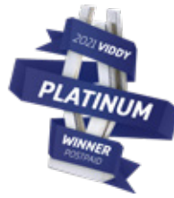
4 VIDDY Postpaid Awards