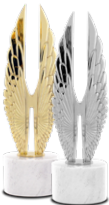
7 Awards for creating creative videos and campaigns 1 Gold and 6 Platinum Awards