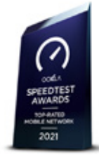
Top-Rated Mobile Network in Saudi Arabia