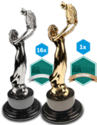
17 Awards for excellence and creativity of marketing campaigns 16 Platinum Awards and 1 Gold Award