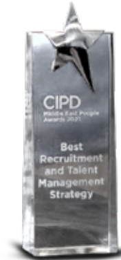
Best Recruitment and Talent Management Strategy Award